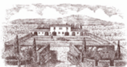
Foto del mondo operaio Casale del Giglio alla Ferrarese